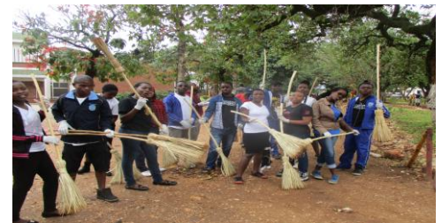
Picture: 10-Children and young people taking part in the clean-up campaigns during GAM

On the last week of the GAM a National conference of children and young people was organised reaching out to 100 children and young people all over Zimbabwe, with the theme "Children and Young People Leadership and Community Development Training of Trainers" . 100 children and young people were capacitated on leadership skills, community development, communication, civic engagement, child rights and project management. The results of the workshop are witnessed by the ability of Child and Youth Led Groups capacity to conduct effective activities in their communities; influencing decisions at local government level and demanding their rights from duty bearers. Below are testimonies from some participants who attended the national.