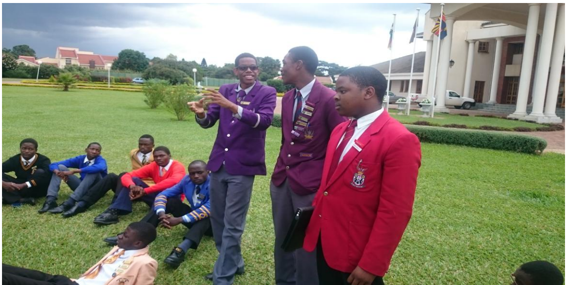
Picture: 6 Boys and Young men having an open discussion on ending violence against children in particular corporal punishment.

relationships of power imbalance and act as watch dogs by informing community leaders on any form of relationship that puts the girl child at risk of early or forced marriage and dropping out of school. During the year under review boys and young men managed to alarm local leaders of 33 cases of relationships that could put the girl child at risk of early marriage, unwanted pregnancy or STI or HIV infection.