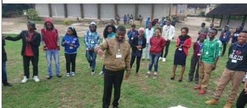
Picture: 9 -Participants at the National conference

On the last week of the GAM a National conference of children and young people was organised reaching out to 100 children and young people all over Zimbabwe, with the theme "Children and Young People Leadership and Community Development Training of Trainers" . 100 children and young people were capacitated on leadership skills, community development, communication, civic engagement, child rights and project management. The results of the workshop are witnessed by the ability of Child and Youth Led Groups capacity to conduct effective activities in their communities; influencing decisions at local government level and demanding their rights from duty bearers. Below are testimonies from some participants who attended the national.