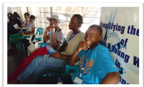
Picture: 5-Children and young people after a training on SRHR and HIV