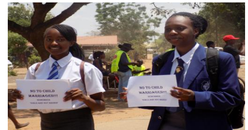
Picture: 8-Girls and young women communicated the no to child marriages messages

The year ended on a high note with the Global Action Month which focused on promoting the ecological rights of children with the theme, "Let's talk future for ecological child rights" . Children and young people in different communities created awareness on ecological child rights and engaged local authorities to take action towards ensuring the ecological rights of children are recognised. Children and young people conducted clean up campaigns in their communities as sign of the need for a clean and safe environment.