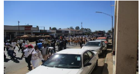
Picture: 7-Day of the African Child in Kadoma and Chinohoyi respectively

Secondly was the Universal Children's Day which was commemorated with the theme on ending violence against children; and reached more than 300 children and adults. During the day children spoke against corporal punishments, physical and sexual abuse which was on the increase in Kadoma. They conveyed messages to the community members on ending early and forced marriage.