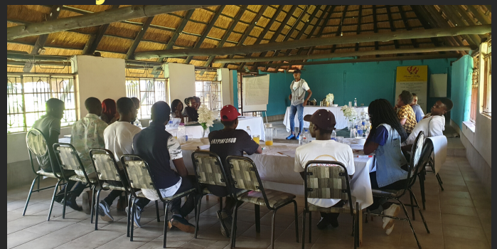
PRESENTATIONS AT ZIM ZAM MEETING