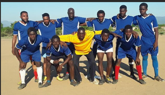
FOOTBALL TRAINING SESSIONS FOR YOUNG PEOPLE AT TONGOGARA REFUGEE CAMP