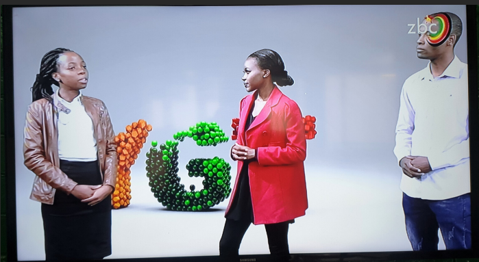
YGT INTERVIEW ON ZBC TV